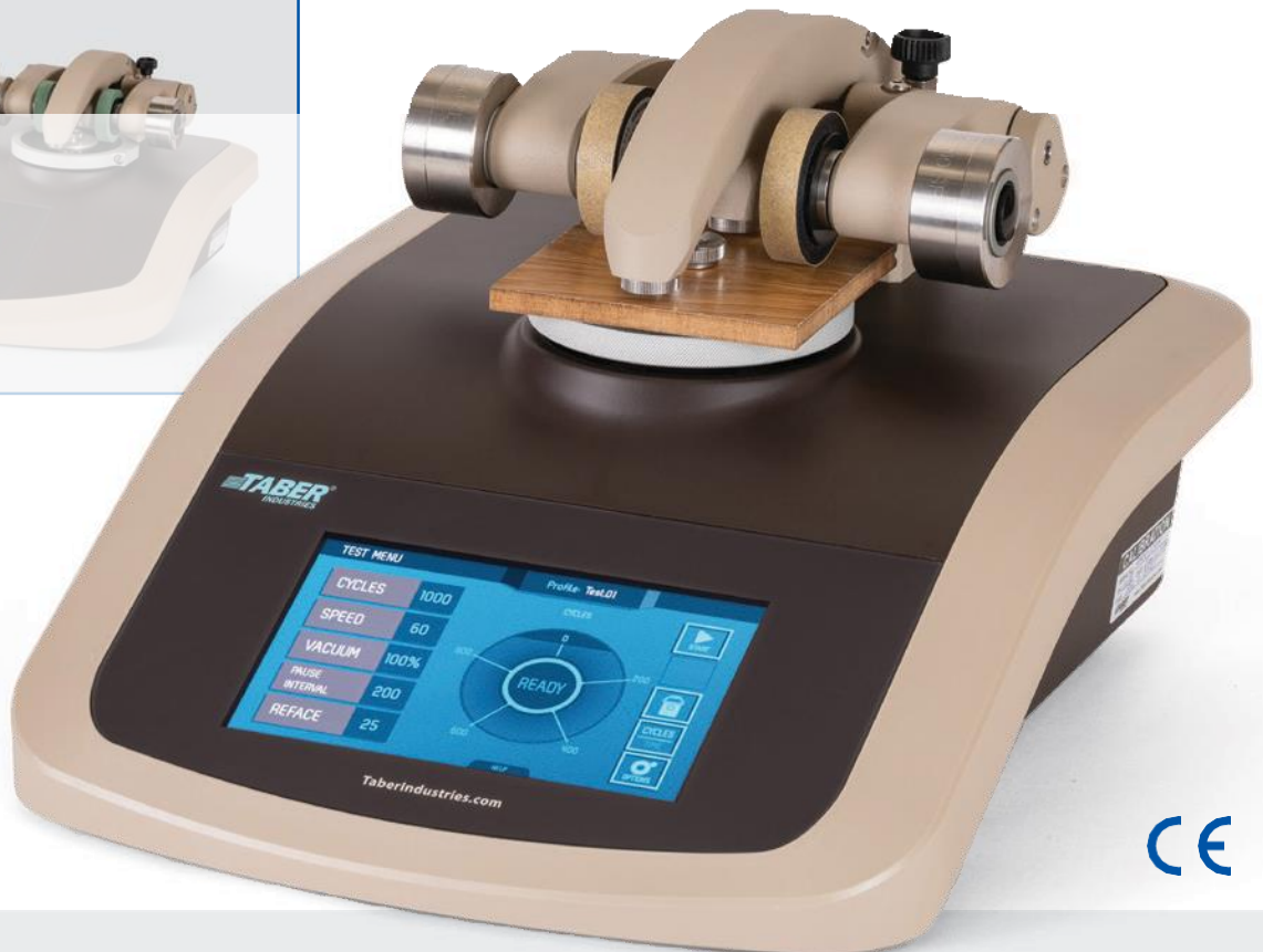
MODEL 1700 SINGLE PLATFORM ABRASER