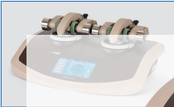
MODEL 1750 DUAL PLATFORM ABRASER